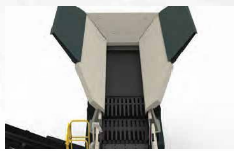
Double deck grizzly pre-screen featuring hydraulic fold and wedge lock hopper, and optional cassettes - punch plate or fingers.