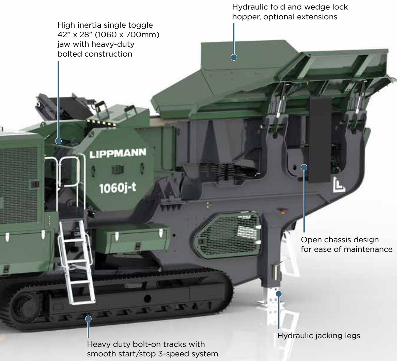
High inertia single toggle 42" x 28" (1060 x 700mm) jaw with heavy-duty bolted construction