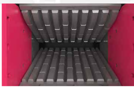
Deep jaw chamber with single toggle design accommodates hard rock applications and large feed sizes. Also features closed side setting adjustment with hydraulic wedges.